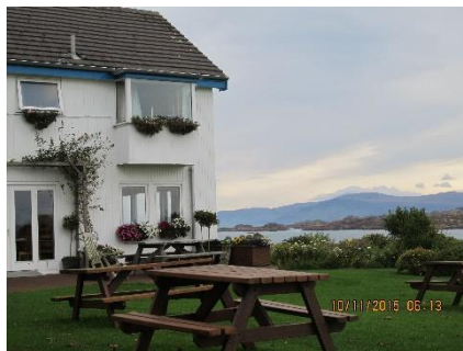
St. Columba Hotel on Iona

WEDNESDAY 24 May: 8am Breakfast. 9 am Morning Prayers at the Abbey with the Iona Community (optional) 10.30 am Meet at the hotel Reception for 10.30am Departure by foot for a Pilgrimage Walk to St Columba's Bay – Traditional landing place of St Columba on Iona) with Picnic Lunch provided. (This is an optional activity that takes about 4-5 hours with some walking up slight inclines on stony or potentially boggy ground. Those with walking difficulties or other preferences can join for part of the journey coming part of the way to the Macha with sea views and then have free time of their own for personal prayers, reflections and relaxation in the village). 5pm Group Meeting at the hotel for Reflections on the Day 7pm Dinner. 9 pm Prayers at the Abbey with the Iona Community (optional) O/N St Columba Hotel, Iona. BLD