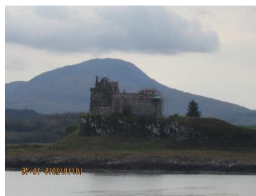
Isle of Mull

TUESDAY 23 May: 7.45am Morning Prayers 8am Breakfast 8.45am check out and transfer to Ferry Terminal for Ferry to Craignure. 9am meet at Ticket office ( DO NOT BE LATE OR YOU WILL MISS THE BOAT! ) in the ferry terminal for 10am Ferry (45 minutes) from Oban to Craignure, then and incredible bus journey across the Isle of Mull to Fionnaphort where we will take leave of the bus and walk on to the Iona Ferry, for the short (10 minutes) crossing to the sacred Isle of Iona. 2pm Check in to the St Columba Hotel. 4pm Meet at reception for Guided Tour of the Abbey and local places of interest (with Marcus) including St Michael's Church and the Abbey Museum, St Columba's Cell, Relig Oran (ancient burial ground of the Kings of Scotland including McAlpin, Duncan and Macbeth ) and Tor Abb – the Hill of the Abbot – ancient site of St Columba's scriptorium. 7 pm Dinner.