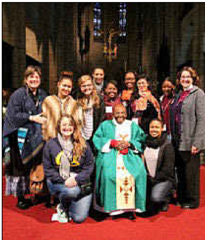
Participants at "Lift Every Voice 2016" who gathered in Botswana and Capte Town, South Africa, pictured here with retired Archbishop and Nobel Peace Laureate Desmond Tutu.