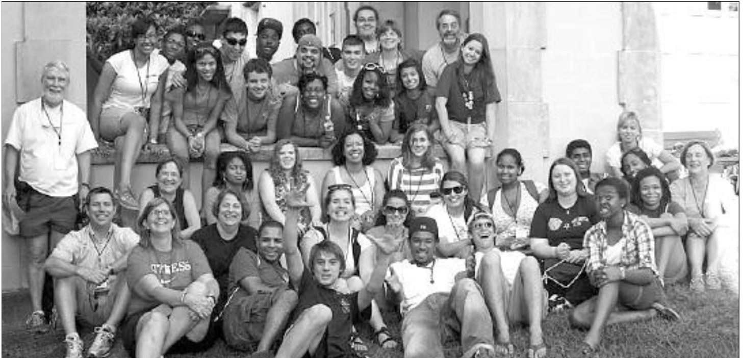
Freedom Ride, above, began in Wilmington, N.C.; below youth work in a cotton field