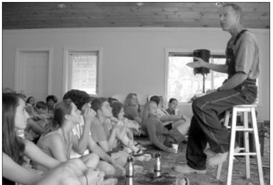
PYE youth learn about Appalachian culture in Townsend, Tenn.