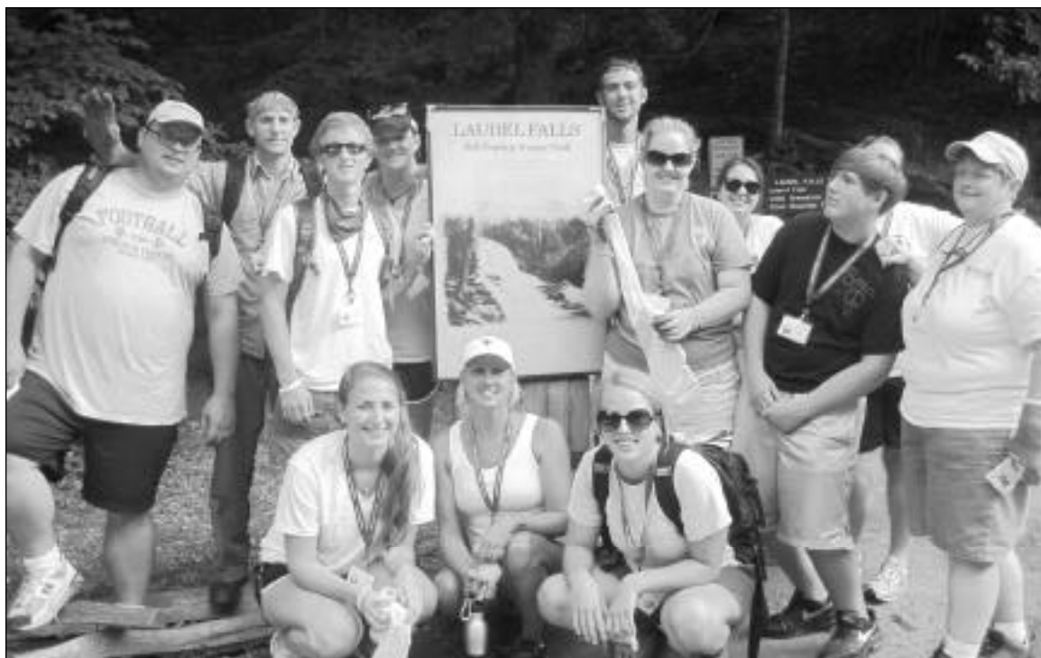
168 youth, adults focus on God's creation at PYE 2010 in Great Smokey Mtns.

In November 2010, the Province IV Youth Ministries Network Continued on Page 9