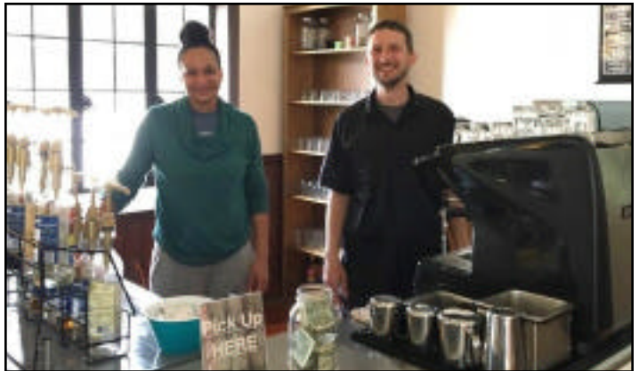
Coffee shop ministry at Florida State University

All of the chaplains and I are tremendously grateful to God and Province IV for the continued love, support and answered prayers, that we continue to enjoy.