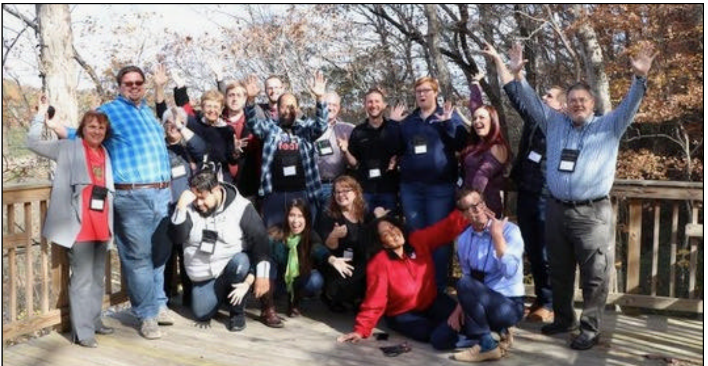
PIV chaplains on retreat at Ignatius House, near Atlanta